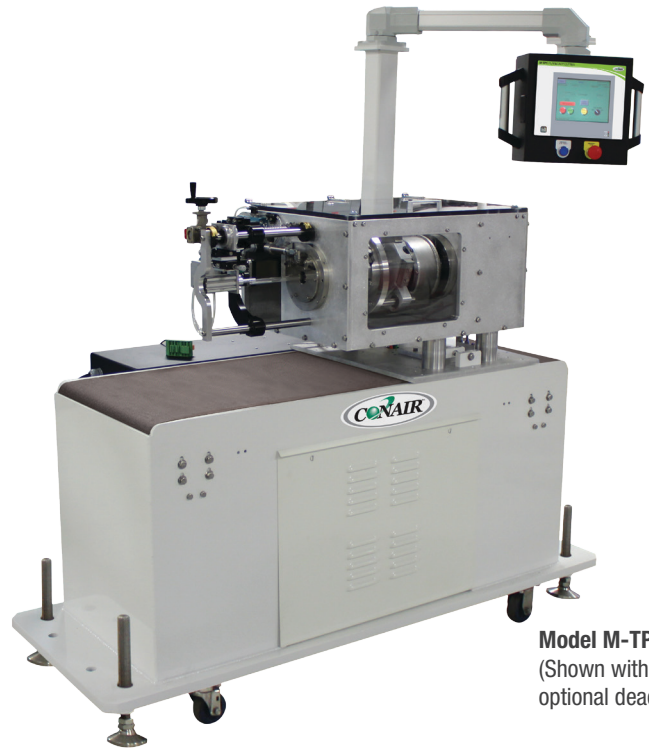
Model M-TPC-1 (Shown with optional dead stop.)

The clamping system and servo table assure quality, planetary cuts. The standard planetary cutter orientation is right-to-left, but left-to-right orientation cutters are available.